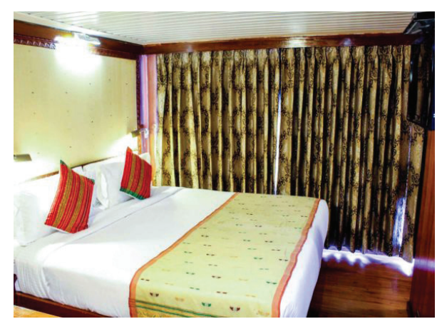
Luxury Cabin with Balcony (230 sqft)

The Brahmaputra is the only river, apart from Africa's Zambezi, on which you can take boat, jeep and elephant-back safaris to view big game animals like tigers, elephants, wild buffalo and white rhino. Mahabaahu provides a very comfortable base from which to view all this action. Its large-windowed cabins -- several of which have balconies.