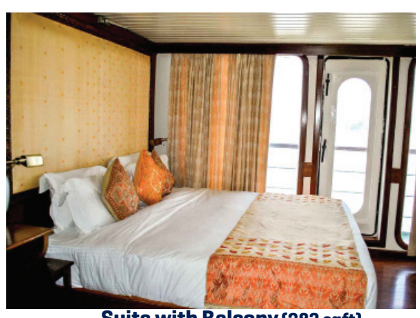
Suite with Balcony (283 sqft)