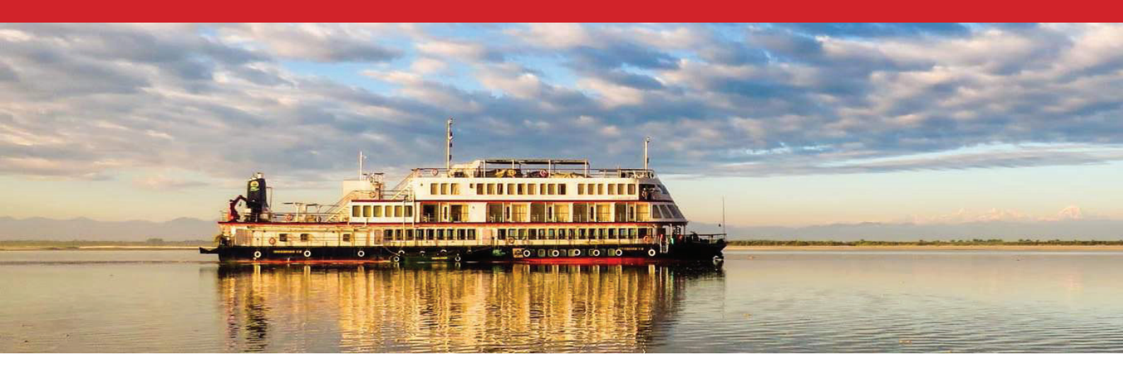
MV Mahabaahu - is the largest and newest riverboat offering cruises along the Brahmaputra River, which winds its way through the verdant 'tea country' of Assam, in the northeast of India.

The Brahmaputra is the only river, apart from Africa's Zambezi, on which you can take boat, jeep and elephant-back safaris to view big game animals like tigers, elephants, wild buffalo and white rhino. Mahabaahu provides a very comfortable base from which to view all this action. Its large-windowed cabins -- several of which have balconies.