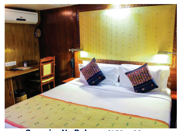
Superior No Balcony (150 sqft)