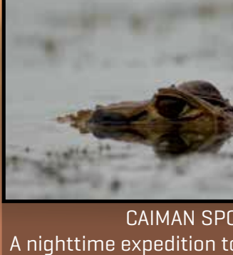
A nighttime expedition to on the lake is a magical with wonder. You will t

Creeping along jungle paths, your naturalist guide might take you through the territory of crested owls or howler monkeys, mimicking the creatures' calls to win their trust and coax them out of hiding.